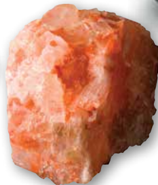
Phillflo ® Flotation Oils are designed to improve the recovery of potash and phosphate by enhancing the flotation of coarser particles.