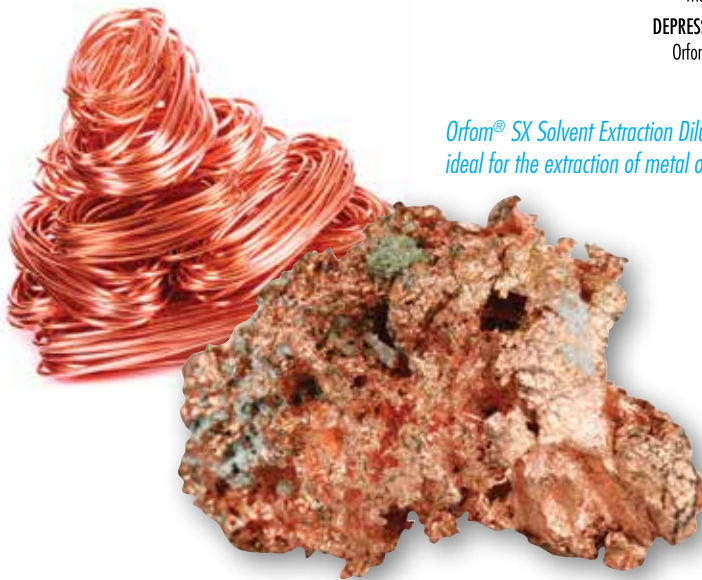
Orfom ® SX Solvent Extraction Diluents are ideal for the extraction of metal oxides.