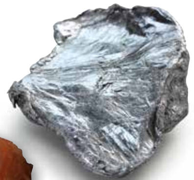
Orfom ® D8 Depressant is an effective depressant in chalcocite, molybdenite and other sulfide ore flotation processes.